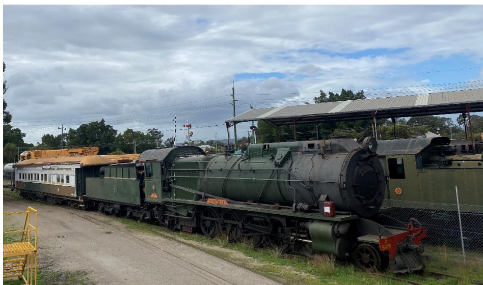
S 549 hauling AQZ 423 ready for its temporary location. The AQZ has had one side restored but the side you can see here could not be done in its previous location. (B Hesford)

S 549 being coaled ready for the Mini Model Railway Expo.