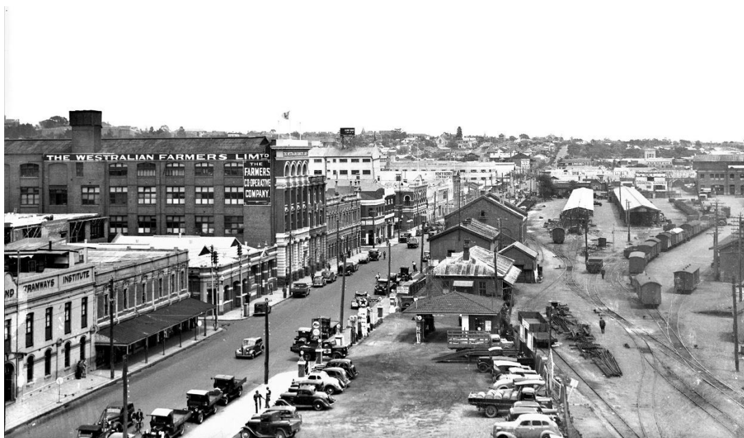
Above: Overall view of Perth Goods