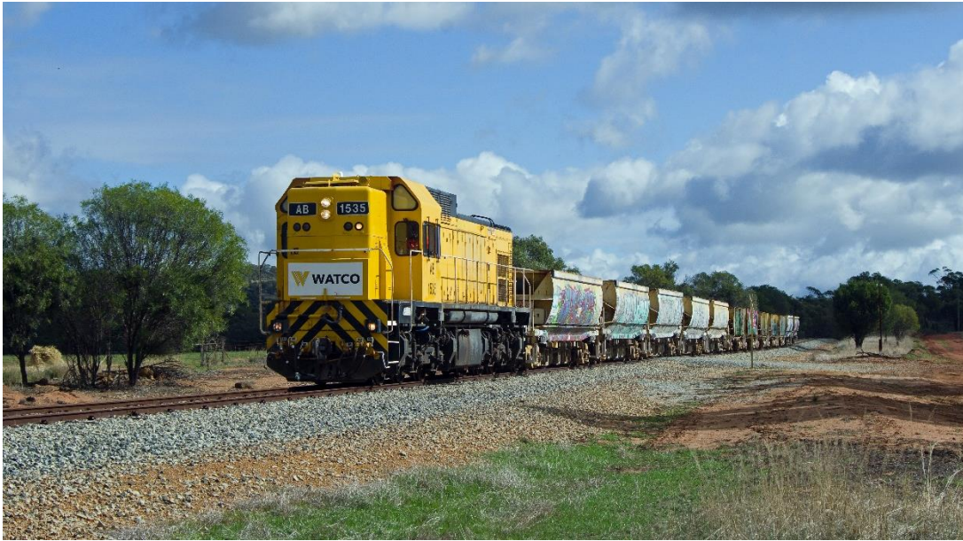
AB1535, now wearing WATCO logos at each end, passes through Wattening, south of Bolgart, with 5BT2 ballast on 2 June

AB1535 ran a ballast programme on the Miling branch from 31 May to 4 June. Loading of ballast was undertaken firstly at Yerecoin, then at Coondle. Line rehabilitation has been occurring in the Bolgart – Calingiri section. On 7 June, AB1535 ran a rail train out of Midland to serve points in the Wheatbelt as diverse as York, Wyalkatchem and Ejanding. The opportunity to service the two DR units at Watco's leased facility within the UGL Rail complex at Bassendean was undertaken in early June.