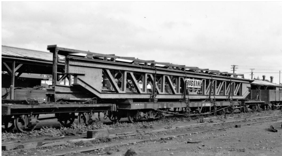
Above: Heavy load in Perth Goods