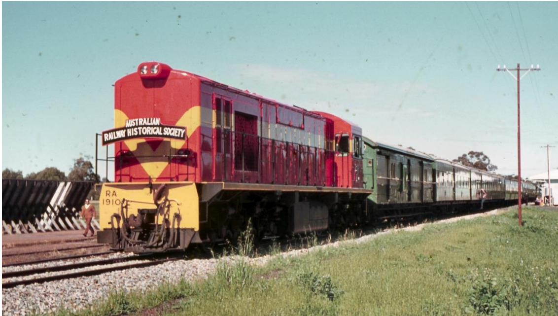
RA 1910 in new International orange livery hauling the ARHS day tour at Mogumber, 28 July 1974 (Jeff Austin)