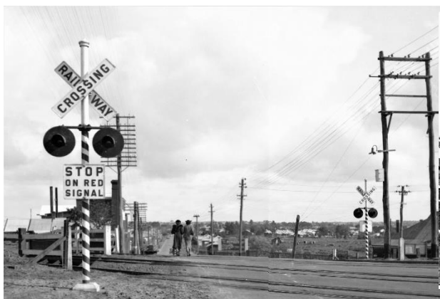
Above left : Jewell street level crossing