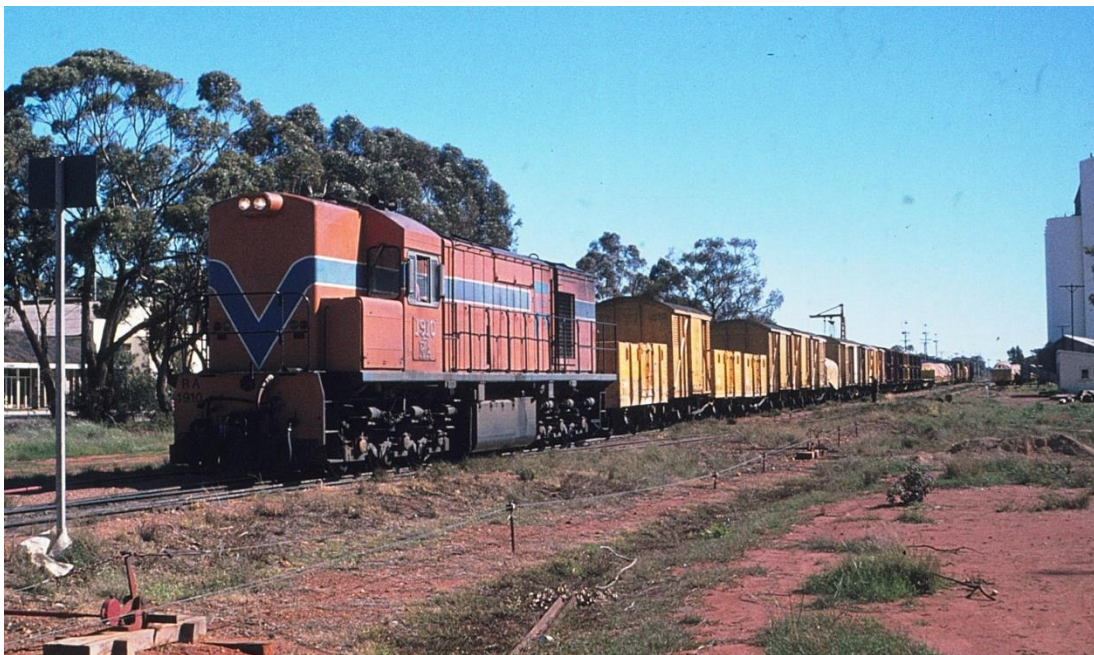
RA 1910 hauling a goods train at Three Springs, 27 July 1979

'1910' received its last major overhaul and engine replacement in May 1986. Time however was running out for all English Electric locomotives and the arrival of the new P class in 1989 was the beginning of the end. '1910' spent a short period as a shunter at Narngulu but was eventually stowed at Forrestfield on 14 November 1990.