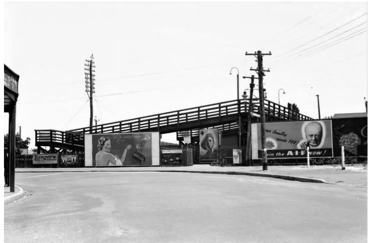
Above) Footbridge at Bassendean station