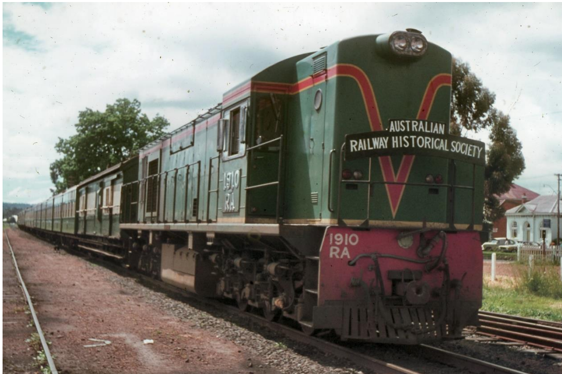
RA 1910 hauling the ARHS day tour at Donnybrook, 14 October 1973

The RA class were displaced from the GSR by the new DA class in 1972 and found their way back to Forrestfield, working to Avon Yard and Bunbury. RA 1910 was even used to haul the ARHS day tour to Donnybrook on 14 October 1973.