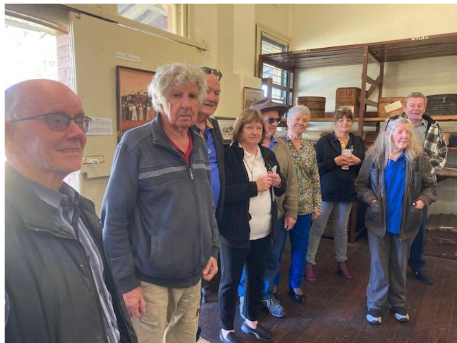
Some of the attendees at Saturday's workshop