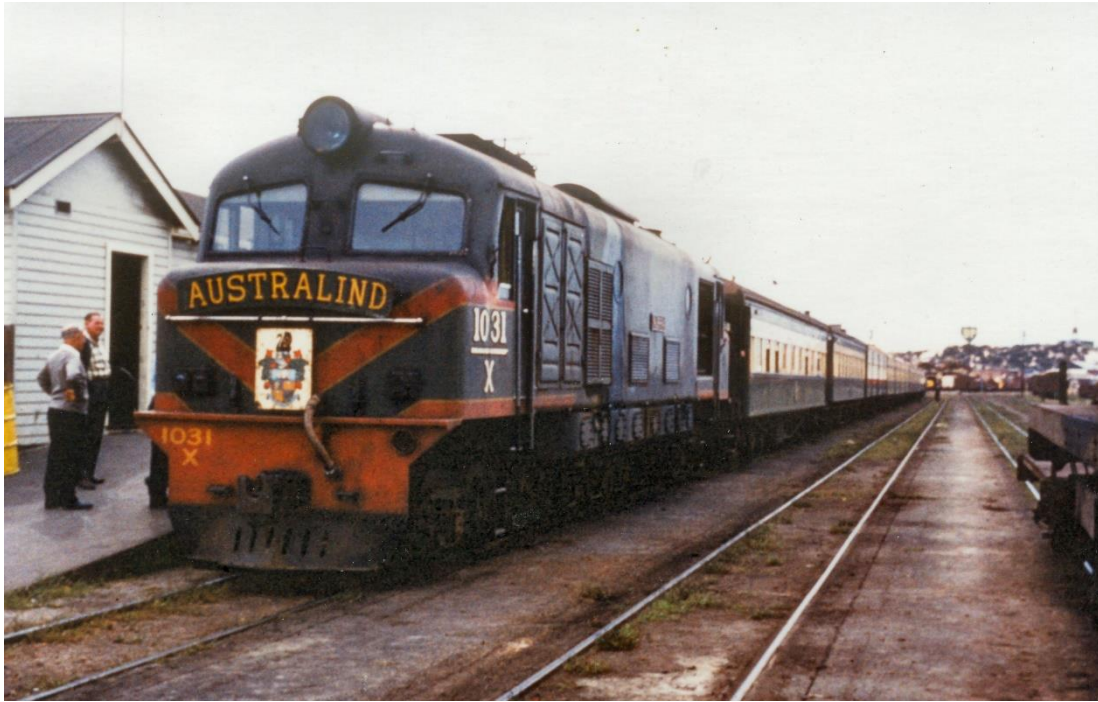
In March 1970 X 1031 "YAUERA" was the locomotive on the Australind in Bunbury.

Also in March 1970 David Beazley photographed a line-up of locomotives around the turntable pit in Bunbury.