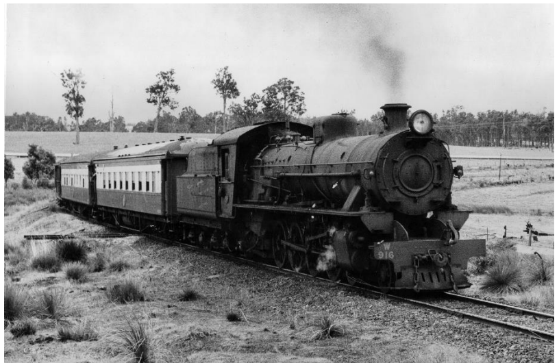
Taken 2 March 1970 by Eddie Woodland with W 916 on a WA Division's Outing Committee Special (ARHS tour train), between Collie and Brunswick Junction.