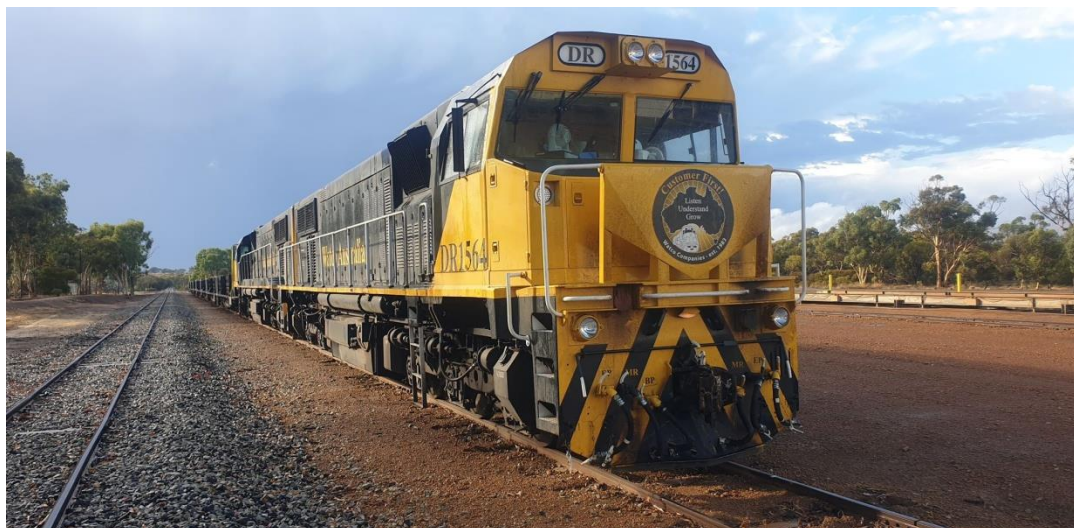
DR1564 and 1565 at Calingiri with 3RT1 rail train on 26 February.

Narngulu, then east via Mullewa. Geraldton had been served by a DR hauled rail train during 2019. On 25 February, the pair provided the inaugural running of a former D class unit on the Miling branch. While the train was planned originally to go the terminus station of Miling, the run was terminated at Calingiri. The DR units ran back light engine to Bolgart on 26 February, then returned to the Flashbutt siding at Bellevue on the following day, leaving the loaded rail fleet at Calingiri.