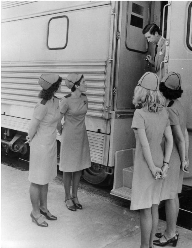
Seen on 16 March 1970 is Prince Charles alighting from a Prospector railcar with a guard of honour of four Westrail hostesses.