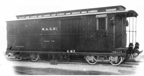
An early photo of a WAGR clerestory guard's van.

Paul Tranter showed six vans, three of which were Commonwealth Railways crew/Guard's vans and one was a Railwest guard's van in all over green livery. Paul also showed two ZJ express passenger guard's vans; one weathered, one pristine.