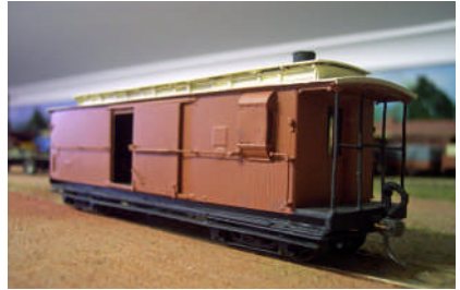
A modified Ajin/North Trunk models Z5070 [Photo and model by Brian Norris]

Gary Gray has a number of guard's vans but brought in only one of his green Z vans to show.